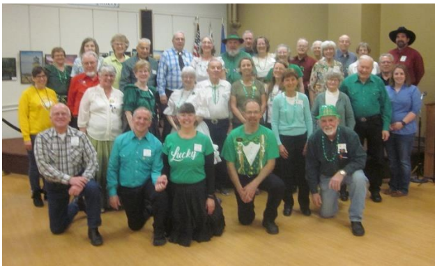
Beaux & Belles – March 16 (already had their banner)