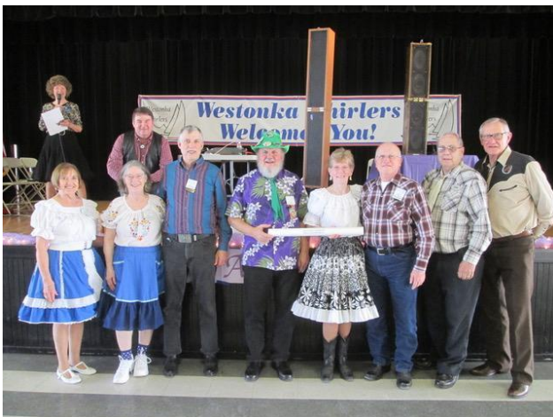
Westonka Whirlers – March 20 (claimed their banner)