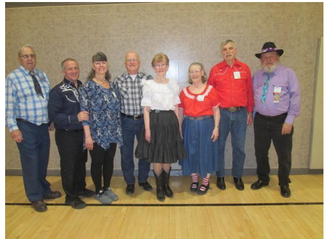
Gospel Plus – March 25