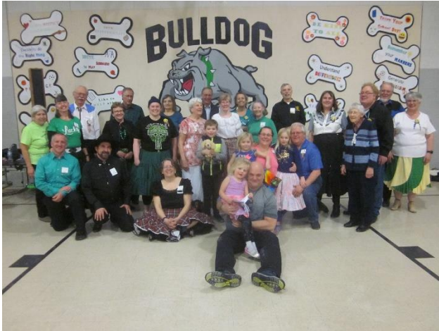
Koronis Nite Owls – March 12 (retrieved our banner)

Some of County Line Squares members March activities: