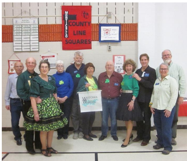
Westonka Whirlers retrieved their banner.

We had seven squares from Afternoon Squares, Ar-Dale Dancers, Beaux & Belles, Cambridge Corners, Hotfoot Stompers, Koronis Nite Owls, Spares & Pairs, and Westonka Whirlers at our March 11, "Green" dance.