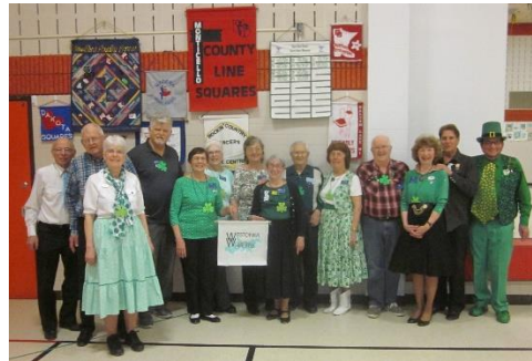
Westonka Whirlers retrieved their banner