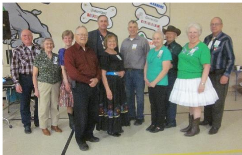
Koronis Nite Owls – March 14 (Retrieved our banner)