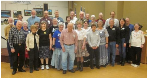
Beaux & Belles – March 4 (Already had their banner)

County Line Squares members are usually busy dancing and claiming or retrieving banners from other organizations. A couple of their March activities are featured below: