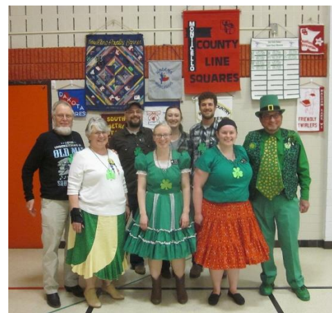
Jolly Twirlers (with an assist from Koronis Nite Owls) had enough dancers for a banner