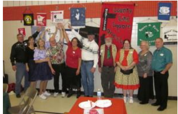
Here are Cambridge Corners retrieving a banner from County Line.